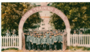
Students at Chemawa, 1905